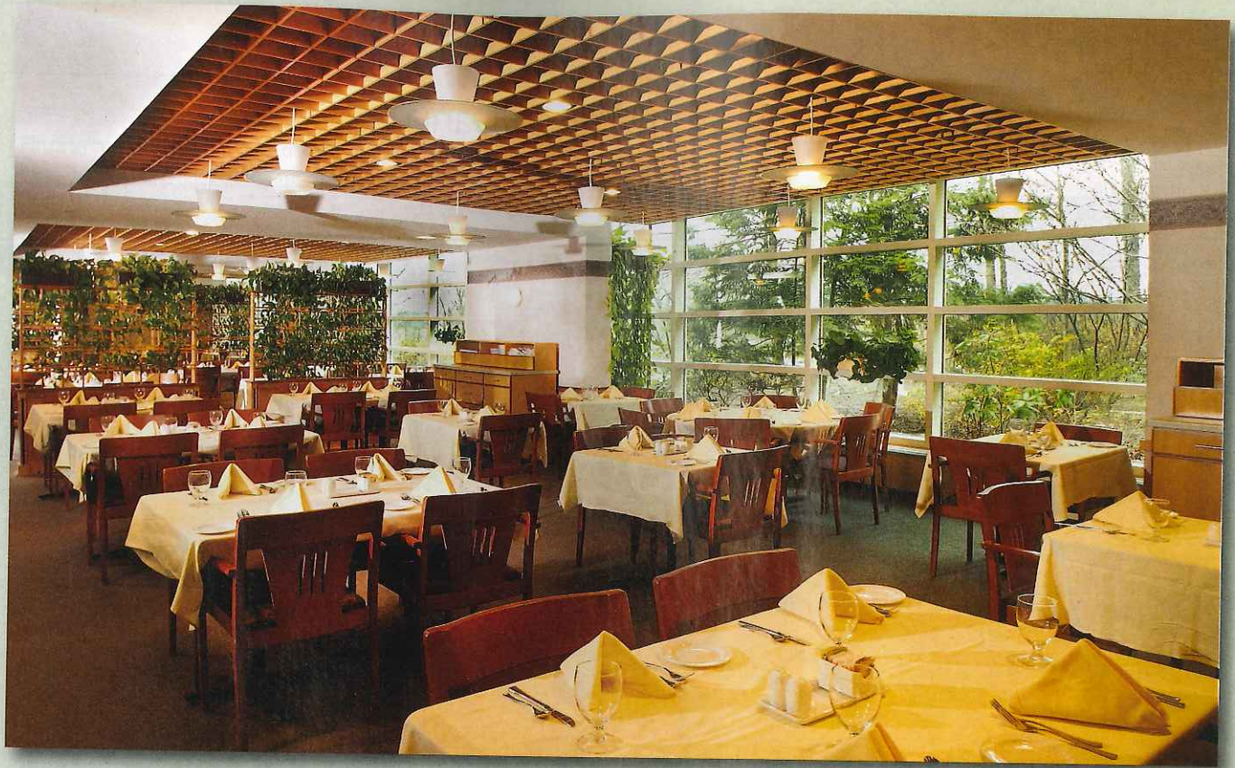
The Gardens Restaurant is an upscale restaurant at the Penn Stater Hotel in State College, PA

State College, PA www.meetinstatecollege.com